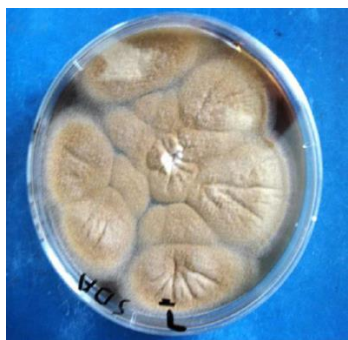
Fig (1): Morphology of Aspergillus flavus culture on Sabouraud's Dextrose Agar medium. (From diabetic patient).