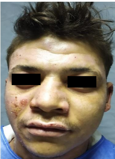
Fig.7: After one week of topical heparin dressing.