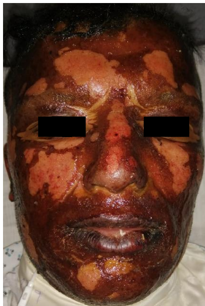
Fig. 2: 28 year's old pt. with deep Partial thickness burn