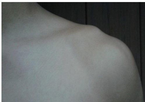
Fig. 1: Acromio-Clavicular (AC) joint dislocation- left shoulder

All the patients underwent complete general and local clinical examination (Fig. 1). We followed the patients for pain, activity level, arm positioning, strength of abduction in pounds, and range of motion according to Constant score. 11 Radiographic examinations (Antero-posterior view showing both shoulders (Fig. 2), and Axillary view)(Fig. 3) were done to assess type of dislocation. Coraco-clavicular distance was measured bilaterally in AP view from most superior point of the base of coracoid process to the inferior surface of the clavicle (Fig. 2). Coraco-clavicular distance difference (CCDD) (which represents the absolute difference in displacement between injured and non-injured sides) was measured at time of trauma and after 6 months follow up.