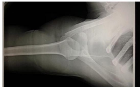
Fig. 3: Axillary View

Non operative treatment consisted of sling support , ice applied for the first 48 hours, symptomatic treatment with nonsteroidal anti-inflammatory medication, and early mobilization of fingers, elbow and wrist . Patients instructed to avoid overhead use of the arm .After the 2 weeks the arm sling discontinued as symptoms subside and strengthening exercises are instituted. Consideration of range of motion, strength, and pain assisted in determining when the patient may return to unrestricted activity. Rehabilitation involved range of motion and isometric exercises progressing to isotonic exercises. Closed chain exercises performed in order to separate scapular movement into individual motions. Our result was evaluated by Wilcoxon signed ranks test and Paired t-test, P value \leq 0.05 was considered statistically significant