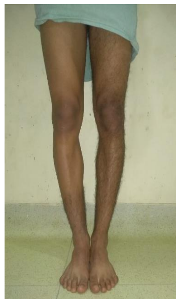
Fig. 5: Preoperative photo showing limb alignment.

The average preoperative varus angle was 9 degrees (range, 5-12 degrees). All knees except one had full correction of their varus deformities to a neutral axis. The mean preoperative proximal medial tibial angle was 82 degree (range, 77-84 degree) whereas the mean postoperative angle was 89 degree (range, 87-92 degree). All knees had full correction of the varus deformity with no collapse at the osteotomy site (Figure 5). The average time for healing of the osteotomy site was 12 weeks (range 10-18 weeks). No healing problems were recorded in this study. All knees had positive Lachman test (grades 2 to 3) and rotatory instability (positive pivot shift test grades 1 to 3) preoperatively. At the latest postoperative follow-up, all knees were stable with negative pivot shift test and anteroposterior laxity <3 mm.