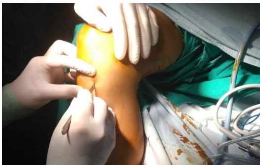
Fig. 1: Anteromedial approach for tendon harvesting.

Operations were performed with patients placed in the supine position and tourniquet was applied to the upper thigh. Autogenous hamstring (gracilis and semitendinosus) tendons were harvested through anteromedial approach (Figure 1).