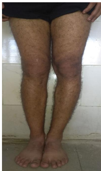
Fig. 6: Postoperative result of the same patient shows the corrected right side alignment.

Preoperative lateral thrust was present in nine knees. This lateral thrust has disappeared postoperatively. All patients had relief of medial knee joint pain. The mean IKDC score significantly improved from 37 to 78 postoperatively ( p < 0.05 ) (Figure 6). All patients returned to preinjury level of activity, and all were fully satisfied with the procedure. The average tourniquet time for the combined procedure was 90 minutes. The operative time was almost equally split between the two procedures.