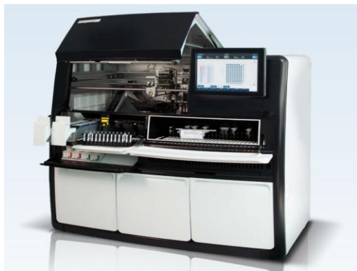
Fig. 1: LIAISON device.

The assay use 3 steps incubation process with overall duration of 65 minutes.