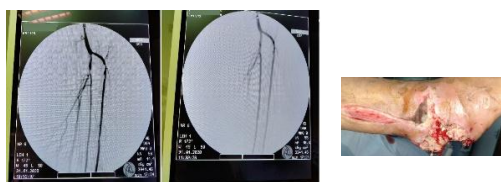
Fig 1: A case of anterior tibial artery repair (indirect angioplasty). Note: Heel ulcer was infected, and debridement was done.

For DR group, 14 (87.5%) patients had their wounds completely epithelialized. Overall limb salvage was 70% (Table 4). Also (Figure 1) shows a case of posterior tibial artery repair (direct angioplasty).