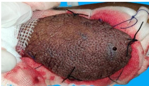
Fig. 1: Congested posterior interosseous artery flap just before initiation of leech therapy.

The flap was then pricked with a needle and the leech was applied with their mouth opening directed to the congested area. The duration of each leech therapy session was recorded and sessions were repeated every 4 hours ( Fig. 1-2-3 ).