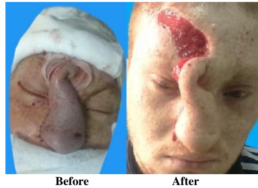
Fig. 10: Male patient 25 years old with pre-expanded 100% congested forehead flap (before). After leech therapy, there is 100% of congestion relief and total flap survival.