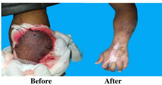
Fig. 9: Male patient 40 years old with congested posterior interosseus artery flap (before). After leech therapy, there is 60% survival of the flap.