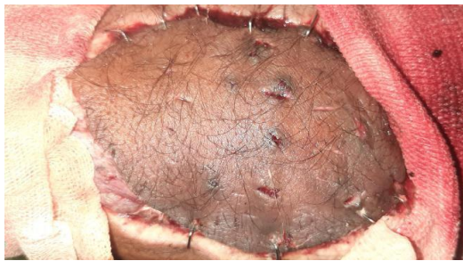
Fig. 7: The posterior interosseous artery flap after the end of leech therapy sessions with almost normal capillary refill time.

Finally, the used leeches were sacrificed after each session in ethanol solution and should not be stored with unused ones to prevent cross-contamination.