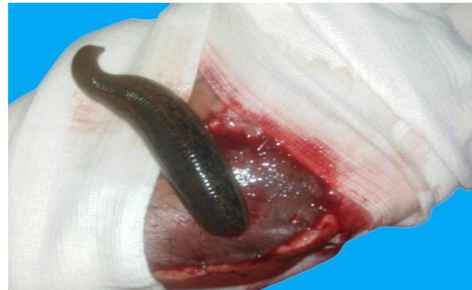
interosseous artery flap with Hirudo Medicinalis just applied.