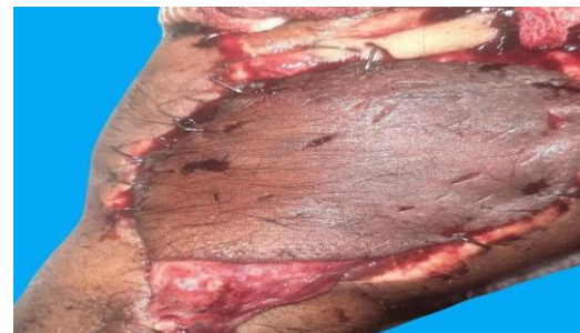
Fig. 4: The posterior interosseous artery flap at the 2 nd day of leech therapy showing less congestion with less violaceous color.

The decision to discontinue the leeches was made according to the clinical response for the treatment ( Fig.4-5-6-7 ).