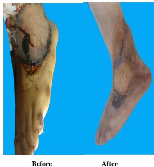
Fig. 11: Male patient 32 years old with 30% congested reversed sural artery flap . After leech therapy, there is 80% survival of the flap.