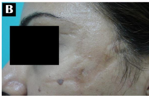
Fig. 2: Female patient 22 years old with post-traumatic scar of 6 years duration in the left zygomatic and temporal area. (A) Before treatment. (B) Six months after nanofat injection, improvement in height and pigmentation was noted with improved pliability.