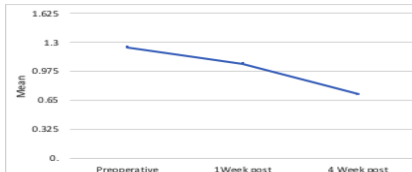
Fig. 3: Preoperative BCVA in log Mar versus one week and four weeks postoperatively

There was a statistically significant decrease in the four-week postoperative CMT (357.73±133.094) than preoperative CMT (497.27±225.420) (P=0.003) (Table 5), (figure 4).