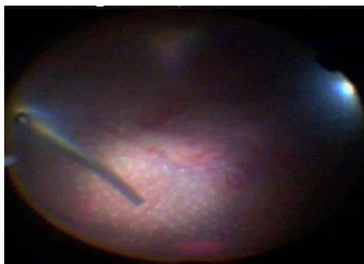
Fig. 2: Panretinal photocoagulation.