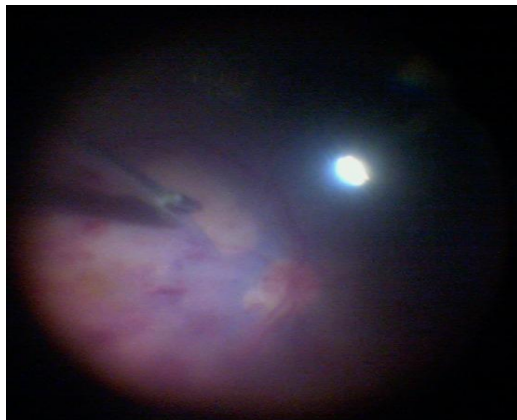
Fig. 1: Internal limiting membrane peeling

All participants underwent a standard 23 gauge vitrectomy, starting with insertion of three trocars, after that core vitrectomy was done then vitreous staining with triamcinolone acetonide followed by posterior vitreous detachment induction, then ILM staining using Brilliant Blue G together with ILM peeling reaching the vascular arcades (figure 1), then complete shaving, then pan retinal photocoagulation (PRP) (figure 2) and finally ranibizumab injection (0.5 mg/0.05 ml) through the trocar leaving the patient without tamponade with massaging on sclerotomies