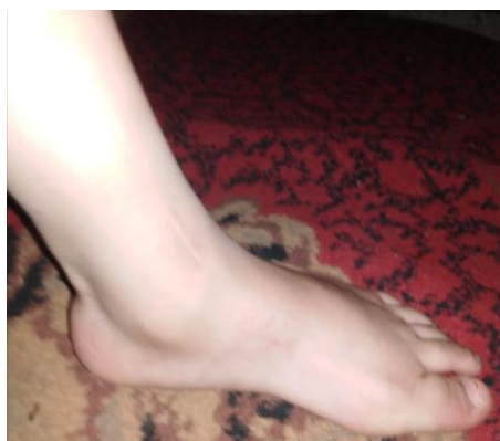
Fig. 4: clinical appearance of foot Postoperatively.