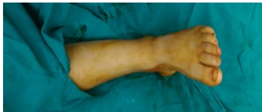
Fig. 2: Preoperative clinical appearance of the foot.