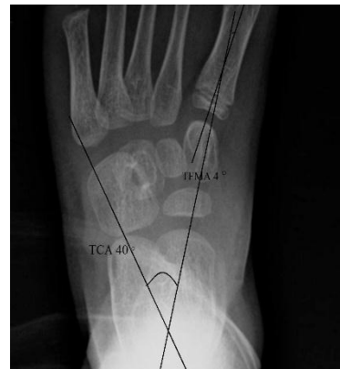
Fig. 5: Postoperative x-rays of the foot.