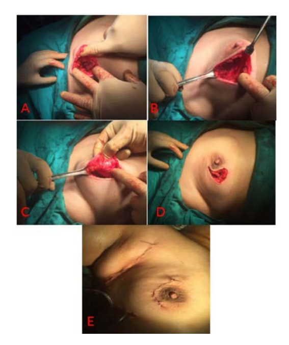
Fig. 1: A case of lumpectomy of a mass 1 cm deep to the NAC with NAC preservation.

Our study included eighteen patients; all of them were treated by lumpectomy with NAC preservation (Figure 1).